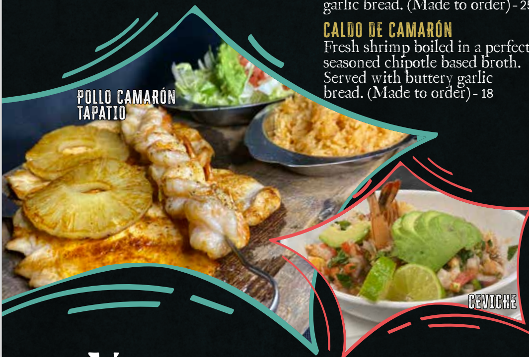
POLLO CAMARÓN TAPATIO

A California mix of steamed vegetables, grilled onions, tomatoes and bell peppers. Served with our famous fajita set-up and tortillas - 14